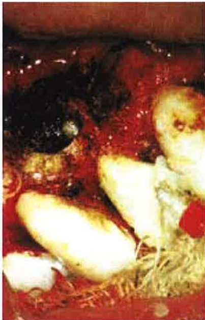
Figure 3. Fitting the clear Luminex Light-Transmitting Post (Den-tatus) after injection of Geristore (Den-Mat).

was small enough to enter the root canal. At the surgically exposed perforation site, we light-cured the adhesive for 10 seconds with a light polymerizing unit. Then we mixed Geristore and loaded it into an Accudose Needle Tube (Centrix) and injected it into the canal from the coronal access opening. Finally, we inserted the Luminex post into the Geristore restorative material to the predetermined length (Figure 3).