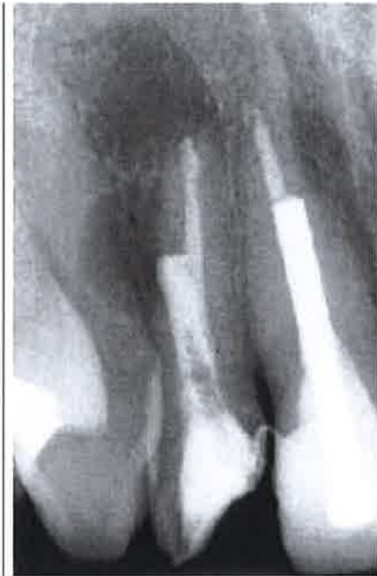
Figure 5. Radiograph immediately after surgery.

finishing bur to remove excess resin ionomer at the perforation site. Then we thoroughly rinsed the site with saline solution to remove any excess resin that remained after finishing of the root surface.