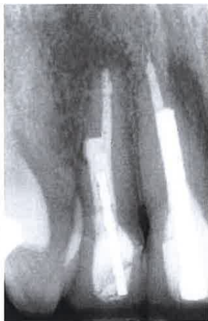
Figure 6. Recall radiograph at one year.

placement at a follow-up appointment (Figure 5).