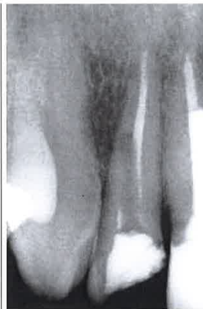
Figure 2. Postoperative radiograph taken after the post was removed.

Phase 2. One week later, the patient returned to the endodontic clinic and had no evidence of swelling; the maxillary anterior area, however, was sensitive to both percussion and palpation. We anesthetized the area and performed a combined surgical and orthograde procedure to seal the perforation. We removed the temporary restorative material from the access opening and reflected a full-thickness intrasulcular flap with a vertical-releasing incision from the distal of the right maxillary canine to the distal of the left maxillary central